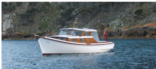
Tideways at Deal Island

At this juncture I must confirm that all times are TOTALLY WEATHER DEPENDENT . We are out there on holidays and have absolutely no interest in dealing with any weather on the nose above 20 knots.