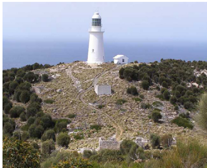
Deal Island Lighthouse, then and now

For any new chums (we very much welcome the first timers) it would be advantageous to stick with either the Tideways or the Storm Bay schedule.